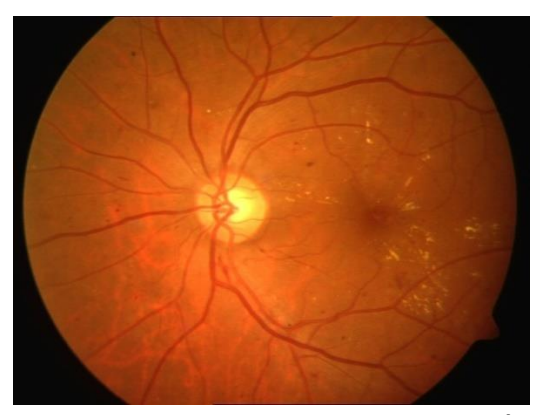
Figure 4- Diabetic macular edema (DME)

Macular edema, characterized by retinal thickening from leaky blood vessels, can develop at all stages of retinopathy (fig 4).